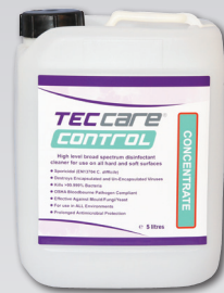
Figure 1. TECcare CONTROL Concentrate

Independent laboratory testing by Speight et al has identified a non-corrosive, chlorine free disinfectant technology which performs to the same level as chlorine dioxide. 3 The disinfectant is TECcare® CONTROL (see Figure 1) which is based on a combination of two quaternary ammonium compounds (QAC), didecyl-dimethyl ammonium chloride (DDAC) and benzalkonium chloride (BAC).