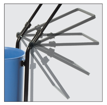
Fold Down Transit Handle