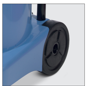
Large Rear Wheels for Ease of Transit