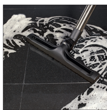
Clean, Dry Floors Again and Again